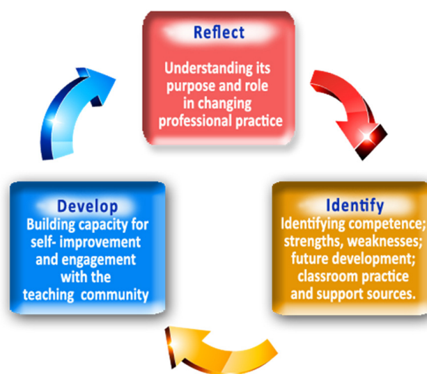
Figure 2: Three-stage model of eportfolio use

correlation into a three-stage model of eportfolio use, “ Reflect-Identify-Develop ” and argue that it provides a coherent and long-term pattern for engaging in the reflective process and supports teacher lifelong learning.